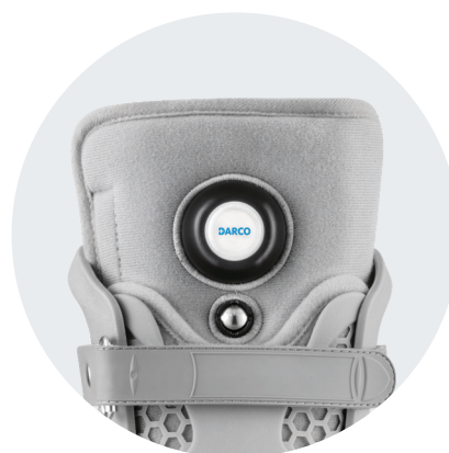
Integrated Air Pump for even pressure distribution