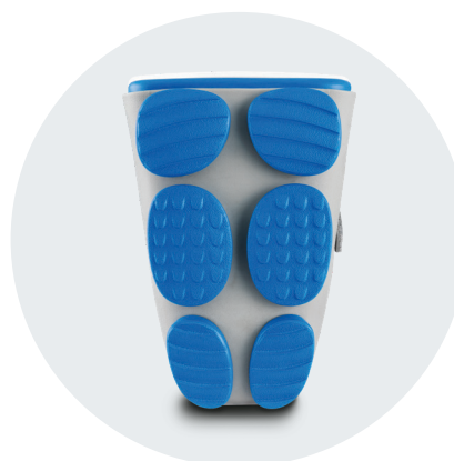
PowerPod Outsole for stability and a secure fit