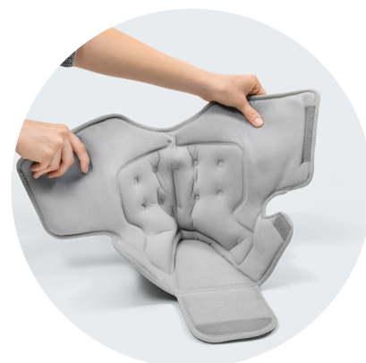
Wide Opening for easy on-and-off